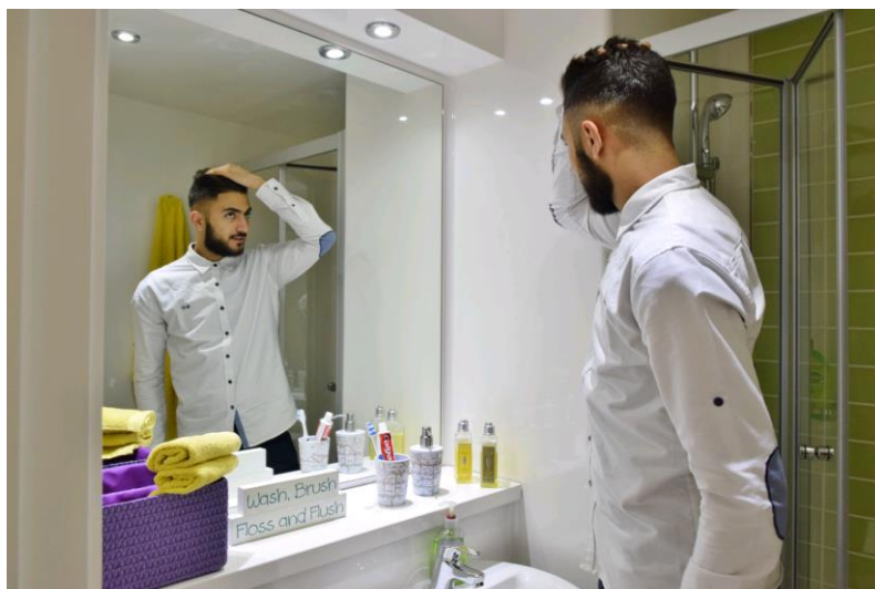
Example of en-suite bathroom at Ravenscourt (please note bath products displayed above are not included)

Modern en-suite bathroom with shower, toilet and sink